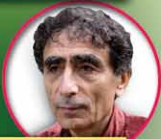
Gabor Maté, MD