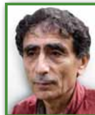
Gabor Maté, MD