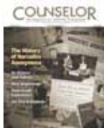
Full time registration— Includes 3 issues of Counselor Magazine

The code printed over your name and address is